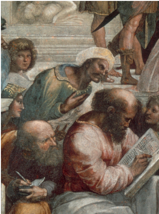
Figure 2: Raffael, The School of Athens, detail: Averroes

the position of minister of justice. The text remains silent on his major influence on the reform of judicial administration. 57