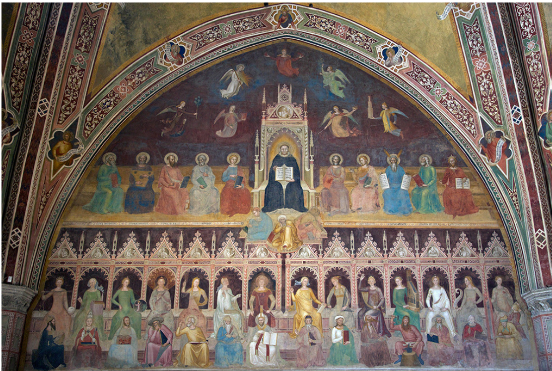
Figure 3: Andrea di Bonaiuto, 1365–1367, Triumph of St. Thomas and Allegory of the Sciences, Spanish Chapel, Basilica of Santa Maria Novella, Florence, Italy

occidental legal tradition, seduces this author to exclude »the Other«: