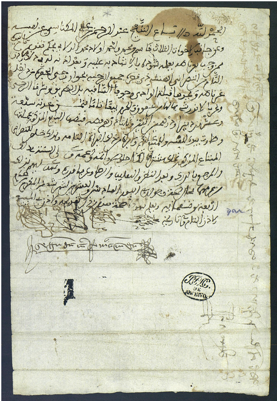
Figures 8.1 + 8.2: Sales contract between Muslim siblings and a Christian, Chabaan 26, 904 (April 8 1499), Documentos Árabes del Archivo Municipal de Granada (1481-1499)