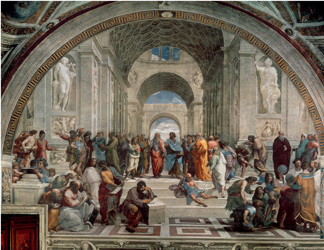
Figure 1: Raffael (Raffaello Sanzio), 1483–1520, The School of Athens. 1509/1510, Rome, Stanza della Segnatura

searches for these in his book Auf der Suche nach der verlorenen Ordnung , but does not mention the presence of a real or imagined law of Islamic provenance nor the fight against it. 53 To be honest, this finding can be pretty much generally applied. The grand master behind l'Europa del diritto , Paolo Grossi, 54 omits this debate during the very interesting section of his work on legal culture in Europe, despite his transcivilizational erudition. Without pretending to have exhaustively studied every publication on this matter, the present text shall concentrate on just a few manuals, to which to need to be added. Neuere europäische Rechtsgeschichte , by Hans Schlosser, who timidly touches