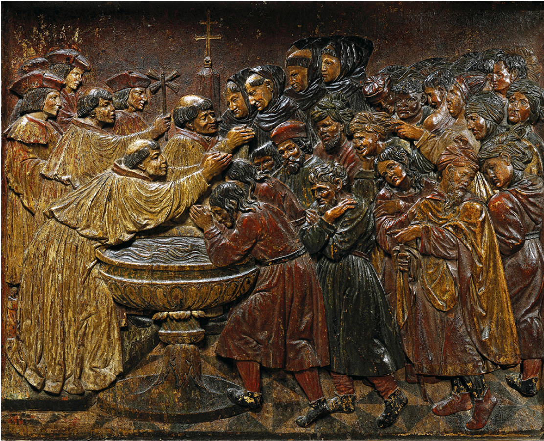
Figure 6: Felipe Bigarny, 1475–1543, Relief depicting the baptism of the Moorish of the Kingdom of Granada, 1520–1522. Royal Chapel, Cathedral of Granada, Spain

tion), by having one evening meal or by speaking Arabic. Unlike in Spain, Islamic law ceased to play any role. As for the Muslims chased out of Portugal, they travelled towards Castile from where their descendants would eventually also be expelled.