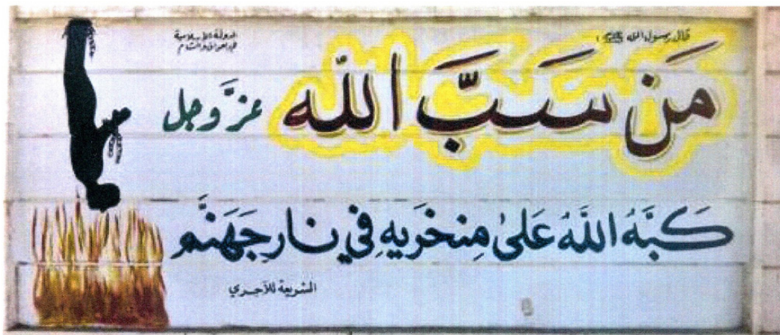
Figure 5: Graffiti in East Aleppo (2013/2014), a hadith attributed to the Prophet Muhammad, explaining the divine punishment for blasphemy: that is to be tortured with fire in hell