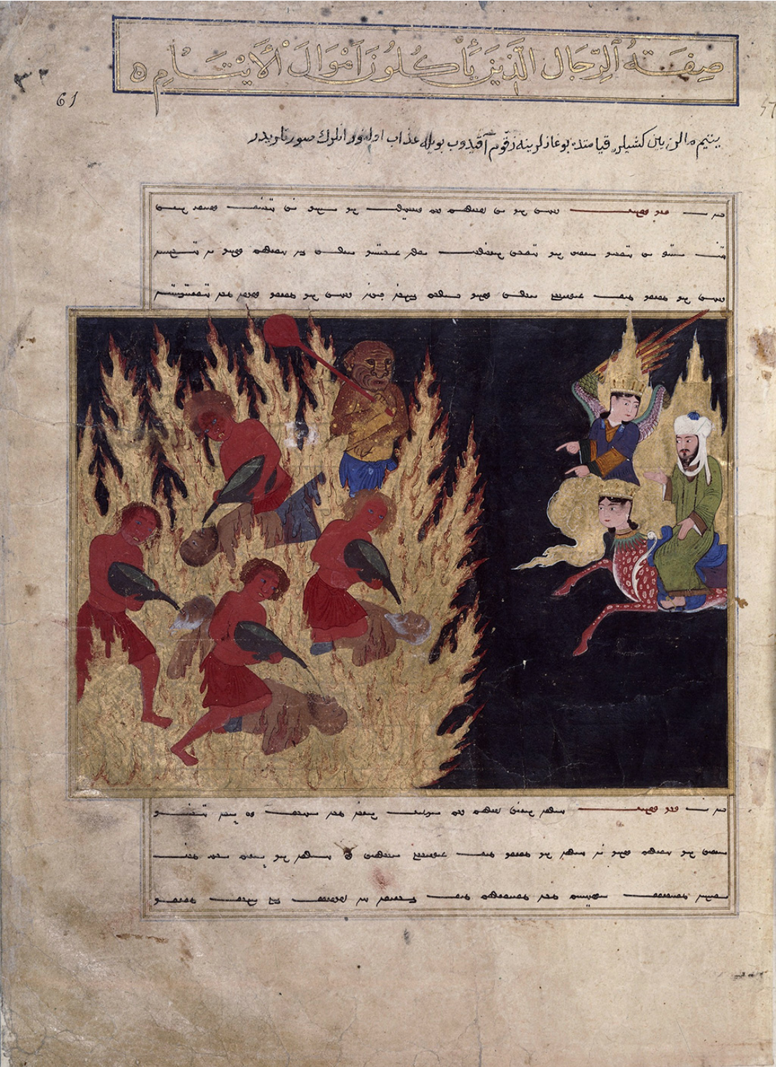
Figure 4: Farid al-Din Attâr de Neychâbour (1436): Le Livre de l'ascension du Prophète. Me'râdj-nâmeh. Mir'ad-j-nâmeh, Copiste: Harou Malek Bakhchi