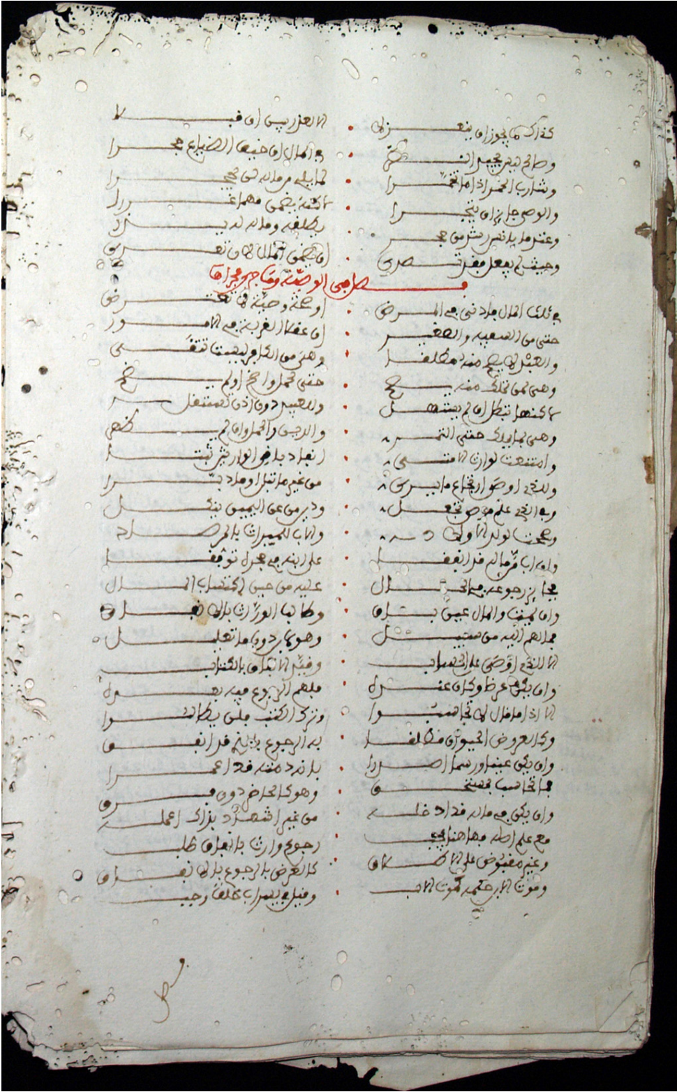
Figure 7: Ibn Asim de Granada, Tuhfat al-hukkam, El tesoro de los jueces. Adquirido en Tetuán, siglo XV, Códice de Tetuán, nº XXXIV-1