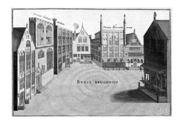
Illustration 1: Antonius Sanderus, Flandria illustrata, Tomus Primus 1641, p. 275<sup>24</sup>

oldest bourse but rather one of three hostels erected and operated by the van de Beurze family: in other words, Ter Beurse in Vlamingstraat 35, the Ter Ouder Beurse in Vlamingstraat 37, and De Cleene Beurse, in Grauwerkersstaat 2. <sup>23</sup> Thanks to Antonius Sanderus' (1586–1664) pictorial reproductions in Flandria Illustrata, we have a fair idea as to the appearance of the Byrsa Brugensis square around the middle of the 17th century.