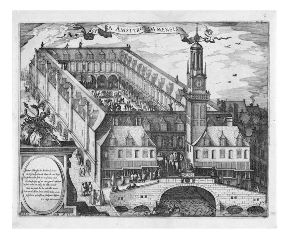
Illustration 3: Byrsa Amsterodamensis (1612), Claes Janszoon Visscher (1587–1652)

The central hub of the economic metropolis was the Byrsa Amsterodamensis , built according to the plans of Henrik de Keyser (1565–1621), in which the first modern liquid commodity and stock market was established. <sup>81</sup> The Amsterdam bourse is also the birthplace of European futures and options trading. <sup>82</sup> In the year 1635, the prices of 350 goods were listed weekly, and also translated into Italian, French and English. <sup>83</sup> The trading of the shares of the Vereenigde Oost-Indische Compagnie