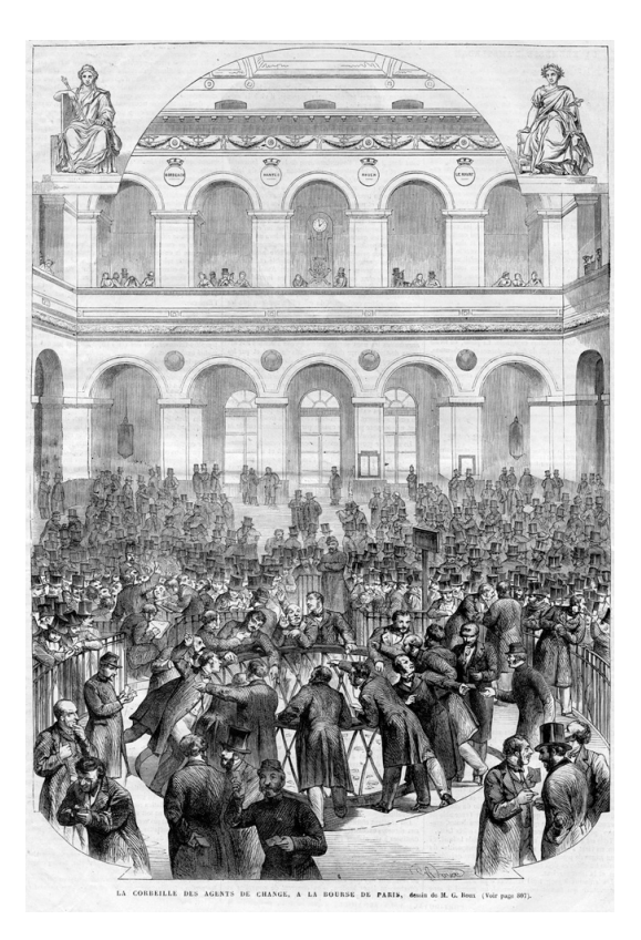
Illustration 5: M. G. Roux, La Corbeille des agents de change à la Bourse de Paris, L'Univers illustré, 1865, p. 805 (Palais de Brongniart)

This spatial division is mirrored in many European exchanges, as can be seen in the Wiener Börse on the Ring, which housed a trading floor and a separate so-called Arrangementsbüro (arrangement office). <sup>118</sup> The exchange hall was dominated by the