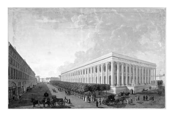
Illustration 4: Palais Brongniart, Paris 1830

The 19th century is the century of exchange buildings, culminating in a dense network of both regional and central exchanges.<sup>94</sup> In many places, the construction of exchanges meant that for the first time, merchants' meetings were accommodated in a specially designed building. In many cities, monumental Basilika-Börsengebäude, as they are called in German architectural literature, became the central hub of emerging capitalism. The exchanges in Trieste (completed in 1806), St. Petersburg (completed in 1816), and the Paris Palais Brongniart (see below figure 4, completed in 1826), as well as - to cite a non-European location - the no longer extant First Merchants' Exchange (1827) of Wall Street, New York, number among the formative examples.95