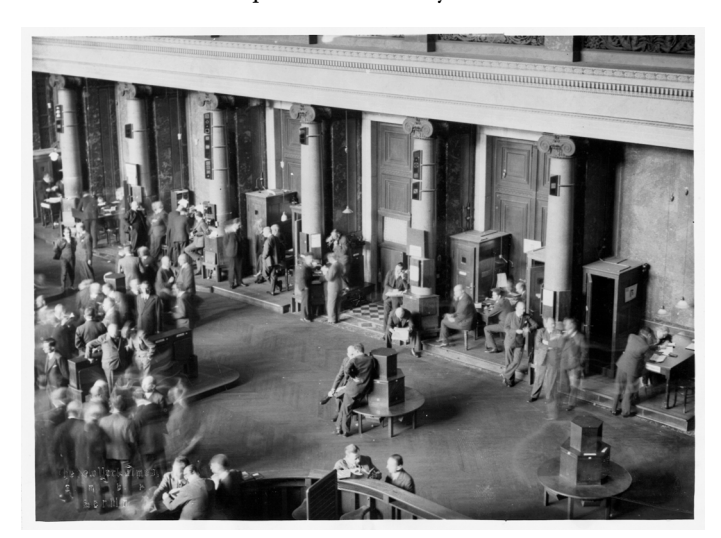
Illustration 6: Trading at the Berlin Exchange in the 1920s

It was computer technology that was to definitively revolutionise the place and methods of trading. Whereas discussion as to the pros and cons of floor trading - the so-called open-outcry, as opposed to computer-operated exchange – may have still been an issue around the 1970s, in the 21st century, the latter technology has evidently asserted itself in terms of sheer practicality and cost-efficiency. 123 The most recent and striking example of this is the CME Group's termination of floor trading for commodity futures in Chicago in 2015 and at the New York Mercantile Exchange at the end of 2016. 124 The Frankfurt Exchange ceased all floor trading on 20 May 2011, when trading was transferred entirely to the XETRA system. 125 These are just a few examples among many.